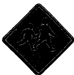
P2 Flag Sign (fluoro orange)

Note 1: See the Fourth Schedule of the Traffic Regulations 1976 for more detail on sign formats and measurements.